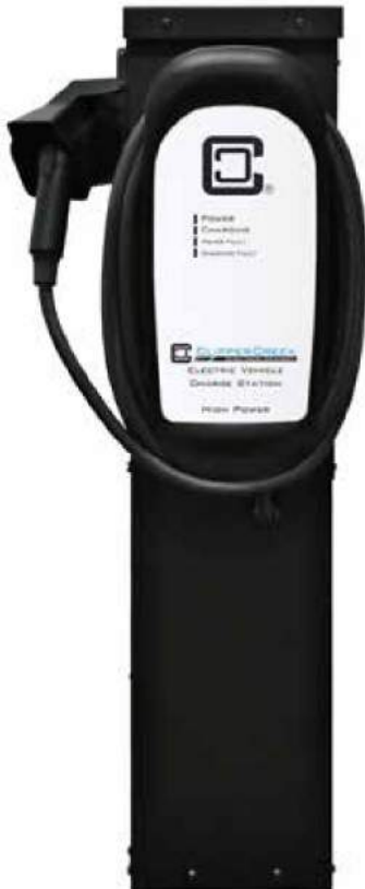
PMD-10R with HCS -60

The PMD-10R is an affordable solution designed for fleet, parking lot, or any harsh environment. Designed to accommodate ClipperCreek HCS, LCS, ACS products as well as the Tesla® Wall Connector. This "ruggedized" mounting solution is an excellent value