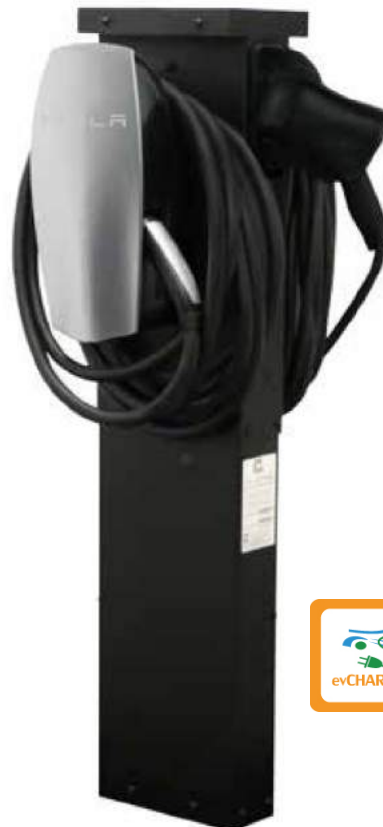
HCS/TESLA® Combo PMD-10T

The PMD-10T has all the same features as the PMD-10, but comes equipped to mount ClipperCreek and/or Tesla® charging stations.