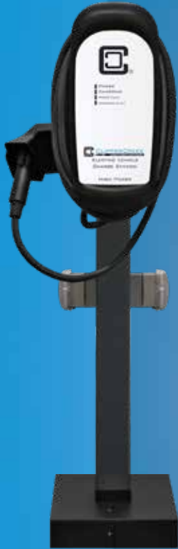
Single-Mount Pedestal w/convenience outlets