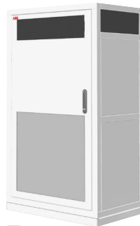
— 175 kW 375 A 150-920 V DC