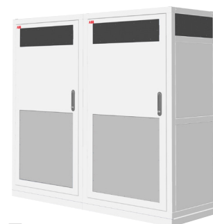
— Dynamic DC 2x 350 kW 2x 500 A 150-920 V DC