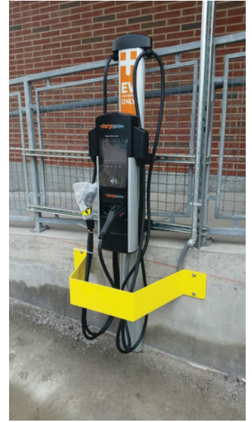
Typical installation shown.